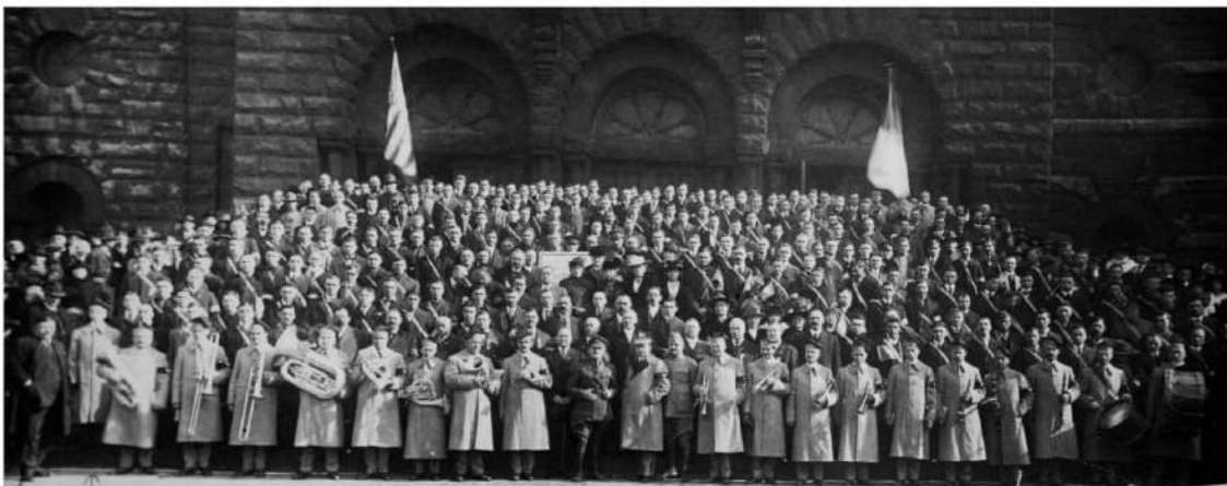
Departure farewell of the Chicago group of volunteers on October 1917

On the 100 th anniversary of the War Effort of the Polish Emigration in America honoring the memory of over 20 thousand volunteers from USA and Canada to the Polish Army (Blue Army) in France 1917 to 1919.