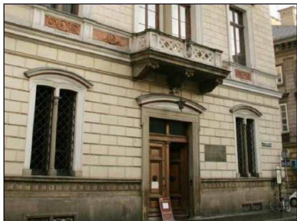
Polska Akademia Umiejętności ul. Sławkowska 17

This is a day trip that includes a funicular ride to the top of Mount Gubałówka with its beautiful panoramic views, time to explore traditional craft shops, the Tatra Museum, and the old wooden village of Chocholów before journeying back to Kraków. Tours depart at 8.45 am from the bus park at 11 Powiśle Street, opposite the Sheraton Hotel or between 8:00 and 8:30 am if being picked up from a hotel.